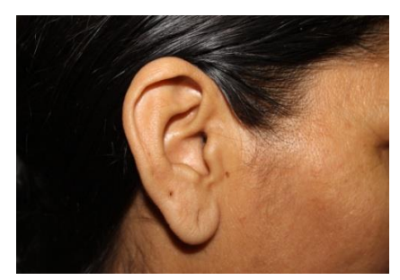
Fig 8: Detached Lobule